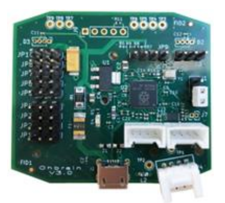
Ohbrain V3 board